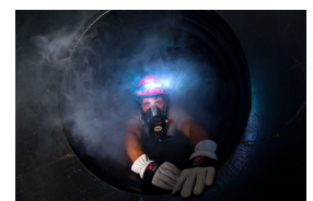
Flammable and/or explosive atmospheres

A world leader in digital thermometers, Rototherm has become the standard for accurate and reliable measurement across the following industries: