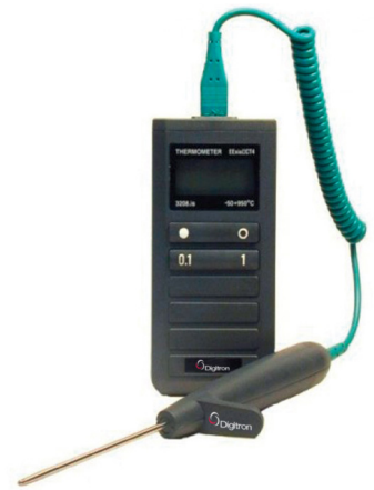
3208 IS Model

For other options, please contact us digitronsales@rototherm.co.uk or +44 (0)1656 740551