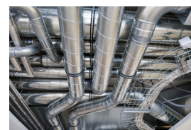
Commercial & Domestic HVAC

A world leader in digital pressure meters, Rototherm has become the standard for accurate and reliable measurement across the following industries: