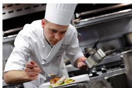
Catering & Food Services

A world leader in temperature gauges, Rototherm has become the standard for accurate and reliable measurement across the following industries: