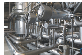
Food Service, Retail & Catering

A world leader in digital thermometers, Rototherm has become the standard for accurate and reliable measurement across the following industries: