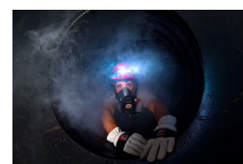
Flammable and/or explosive atmospheres

A world leader in digital manometers, Rototherm has become the standard for accurate and reliable measurement across the following industries: