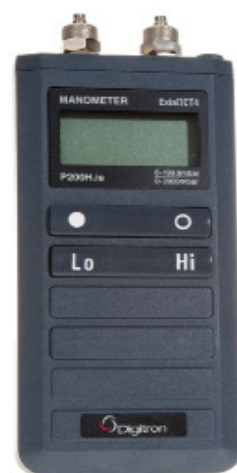
P200 IS Model

For other options, please contact us digitronsales@rototherm.co.uk or +44 (0)1656 740551